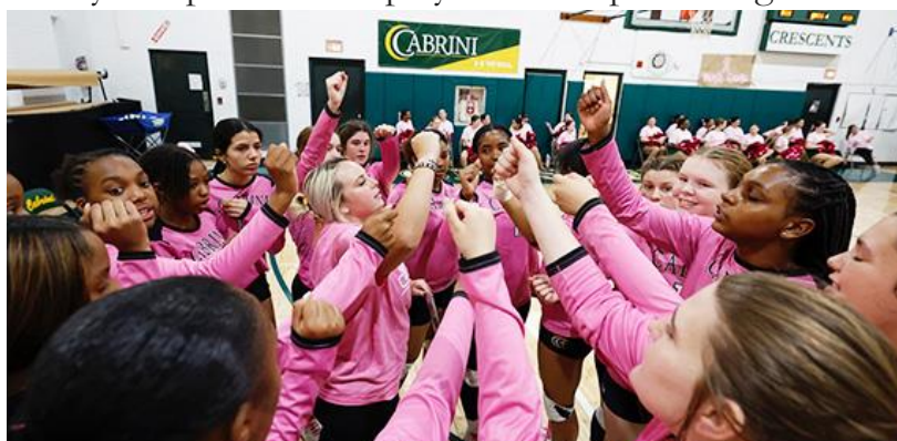
The Cabrini varsity volleyball team – in pink – huddle before this year's Pink Game.

The Pink Games have become a cherished tradition at Cabrini each October, bringing together our Crescent community in a powerful display of team spirit and generosity. From pink jerseys and volleyballs on the court to pink spirit shirts and pom-poms in the stands, the energy and enthusiasm behind this initiative continue to grow each year.