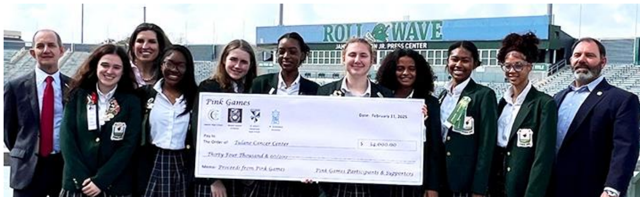
Cabrini's volleyball team present a check for the Tulane Cancer Center's Patient Relief Fund.

Honoring Mother Cabrini's mission to serve those in need, Cabrini High School proudly joined other local Catholic high schools in the New Orleans area to raise funds for the Tulane Cancer Center's Patient Relief Fund through a time-honored volleyball tradition known as The Pink Games .