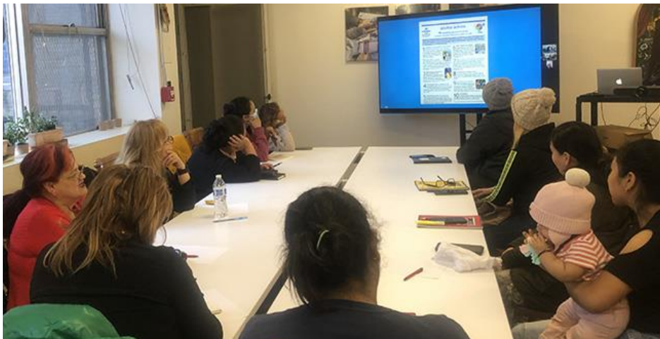
Providing helpful information for community members, last week, CIS-NYC held a nutrition workshop.

Looking ahead to February, we are organizing various workshops, including a session on tax filing as an immigrant and a family preparedness workshop with our social services team to go over parental designation in NYC. These efforts aim to provide concrete tools for families navigating uncertainty.