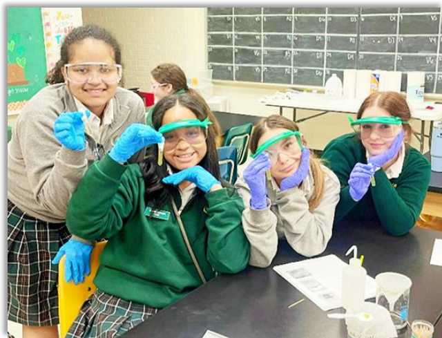
Biology I students try their hands at test tube experiment.

In addition to anatomy, our AP Biology students recently explored the building blocks of life by constructing DNA models and tracing its journey through