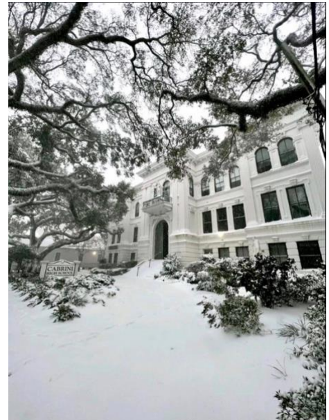
A rare and magnificent scene on Esplanade Avenue.

For more photos shot by Fox 8 news team: https://www.facebook.com/share/r/15VVtDTpmM/