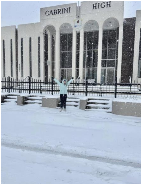
Yippee!!! It's snowing!! A CHS student expresses her exhilaration as the snow continues to fall.

SNOW in NEW ORLEANS!! It was such a fun and memorable moment for the students, all of us. For one day, we were ALL children again. A whole foot in NOLA!