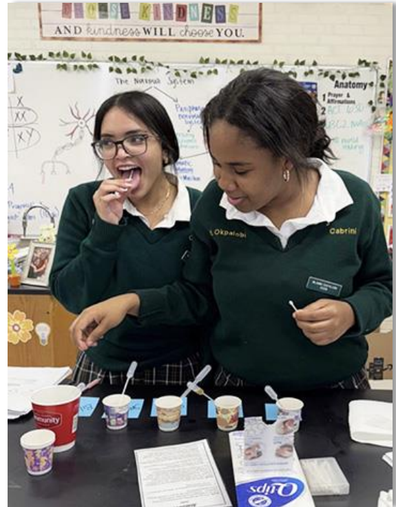
Tastebuds in Action! CHS students explored how humans perceive flavor and mapped tongue sensitivity conducting blind taste tests.

To wrap up their study of the nervous system, anatomy students delved into the fascinating world of sensory perception. Through creative activities like color blindness tours and blind taste tests using soda and Skittles, students discovered the science behind how we perceive taste and sight. Mapping the tongue's sensitivity to sweet, sour, bitter, and salty flavors gave students a better understanding of how taste buds function. Meanwhile, a sensory prick test revealed which parts of the body are most sensitive to touch, while an exploration of the blind spot demonstrated how our eyes adjust to missing visual information. These hands-on laboratories made the abstract concepts of sensory science tangible and memorable.