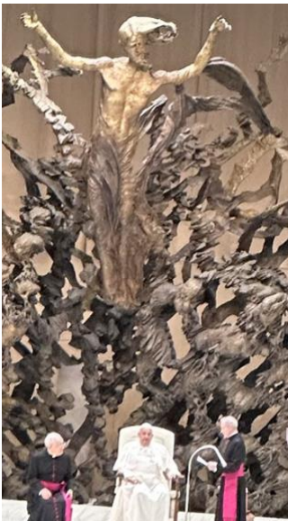
Pope Francis delivers his message to journalists and communicators.

The following morning, the communicators set off from Piazza Pia with the Jubilee cross, taking part in a pilgrimage of prayer towards the Holy Door of St. Peter's along the Via della Conciliazione. After the blessing in the Basilica, the participants headed for the Paul VI Hall for a meeting organized by the Dicastery for Communication followed by an audience with the Holy Father, Pope Francis.