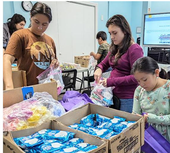
As the saying goes, “many hands make light work” and so it was with the CIS students who pitched in to put together these helpful packets.