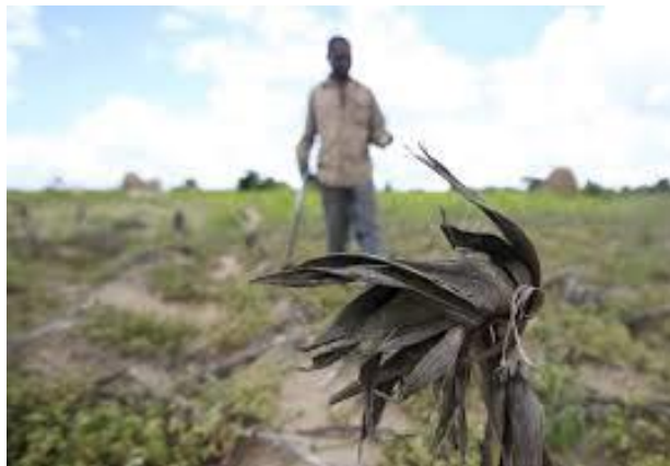
A Zimbabwean man walking through his drought-affected corn field outside Harare.

Migration has been a defining reality of the human experience; that is not going to change because of 19th-century innovations like national borders. In countries like Iran, Pakistan, China, Myanmar and Bangladesh and in nations across Africa and Latin America, thermal limits will be breached; people will either adapt or, when that is not possible, they will be on the move to escape the heat.