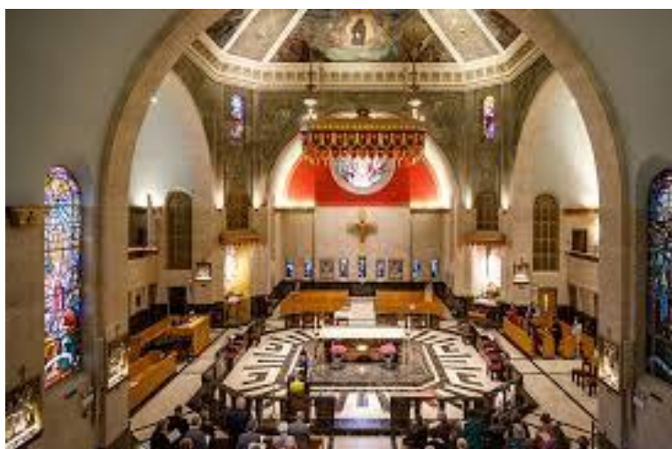
The National Shrine of St. Frances Xavier Cabrini.