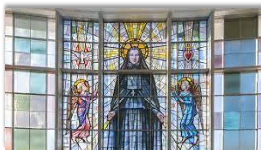
Stained glass window at St. F.X. Cabrini Shrine.