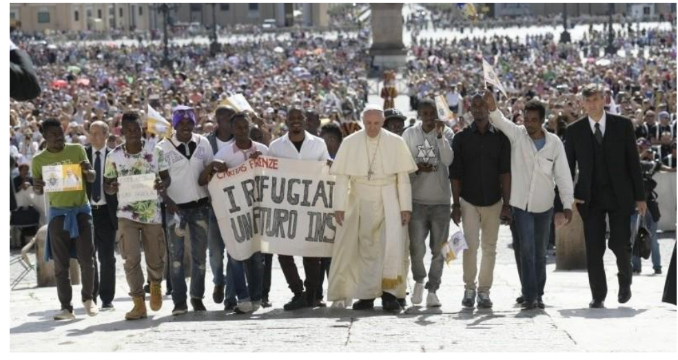
Pope Francis walks with those who are migrants and refugees.

The Catholic Church observes the World Day of Migrants and Refugees on the last Sunday of September each year. Leading up to September 29, the Catholic Church in the United States is celebrating National Migration Week (September 23-29), calling attention to the challenges confronting migrants and refugees, from their country of origin to their destination, and how Church teaching calls on Catholics to respond with compassionate acts of love. Catholic dioceses, schools, charitable organizations,