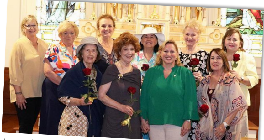
Honored for their philanthropy and for preserving traditions, the Elenian Club was welcomed to CHS.

The Elenian Club: A group dedicated to preserving the Italian heritage in New Orleans by facilitating the annual St. Joseph's Altar. The group also funded the needed repairs to the Sacred Heart chapel roof.