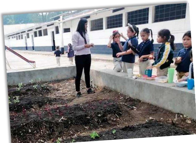
Photo above: There is no better way to teach children about nutrition than having them plant and nurture their own seedlings. Here these little girls are checking on the progress of their plants.

School Gardens: Tending to the school gardens is part of the activities for youngsters in nutrition and food security. The gardens complement actions such as child nutrition monitoring, food at home, and training.